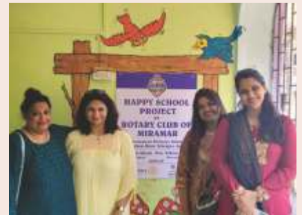
Happy Faces After Happy School Inauguration