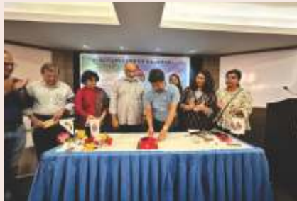
Celebrations in Meetings