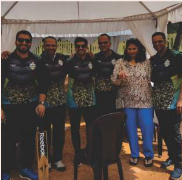
RCM Geared up at Manek Gem Cricket Tournament