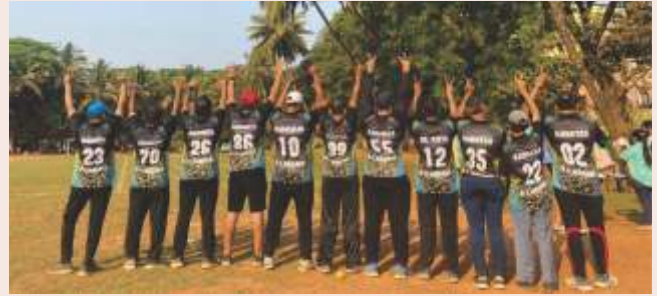
Manek Gem Cricket tournament