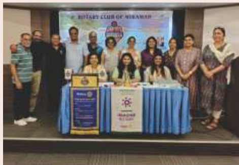
Meeting followed by Karaoke